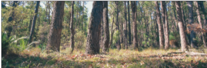
Jarrah regrowth forest

Through conscientious forest management and dedicated development by WA manufacturers' and downstream processors, natural feature timber is now being used in a range of high quality, highly sought after timber products, especially furniture and flooring.