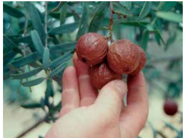
Mature sandalwood fruit, with brown cardboard-like skin enclosing the round nut.

Sandalwood trees produce flowers during January-April. The flowers are very small (3-5 mm wide) and produce nectar that attracts flies, bees, wasps, ants and native cockroaches. The flowers develop into single fruits that mature during August-December. The mature fruit consists of a brown leather-like skin that encloses a hard smooth, round nut. The nut is 15-25 mm in diameter. The nut has a hard shell, and within the nut is a white edible kernel, similar in composition to almonds, peanuts and macadamias.