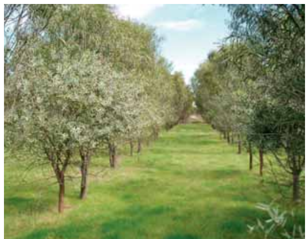
Six-year-old sandalwood plantation established by FPC near Narrogin, W.A.

The FPC advises farmers where to plant the trees, carries out the planting, manages the plantation and harvests it when mature. A financial package provides landowners with a choice of up-front payments, annuities, profit sharing, or a combination of these.