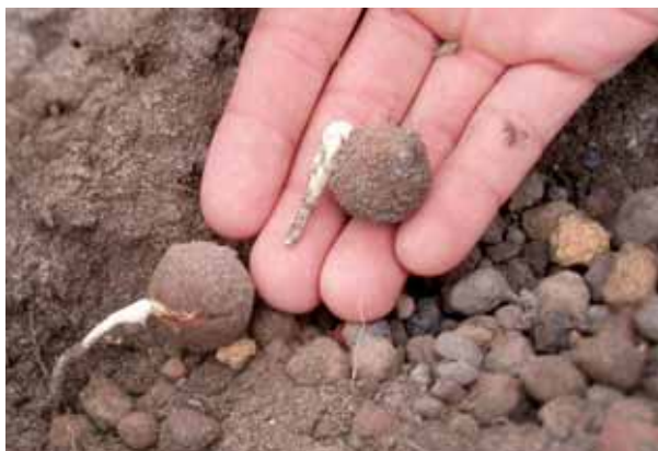
Germinating sandalwood seed, 2 cm in diameter.

Rock sheoak ( Allocasuarina huegeliana ), wodjil ( Acacia resinimarginea ) and mulga ( Acacia aneura ) can also be useful long-term host species, but should generally be planted in combination with at least 50 % A. acuminata on suitable soil types.